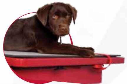
Table-level animal restraints are on both sides of the table-top for easier positioning.